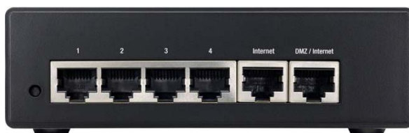
Figure 2. Back Panel of the Cisco RV042G

Figure 2 shows the back panel of the Cisco RV042G. Figure 3 shows a typical configuration.