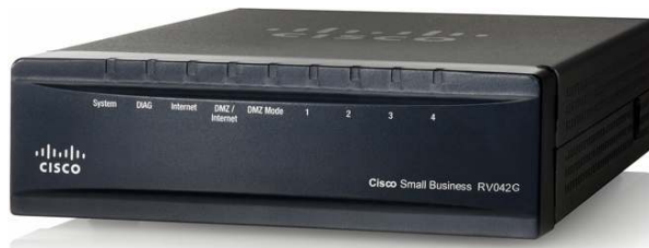
Figure 1. Cisco RV042G Dual Gigabit WAN VPN Router

To further safeguard your network and data, the Cisco RV042G includes business-class security features and optional cloud-based web filtering. Configuration is a snap, using an intuitive, browser-based device manager and setup wizards.